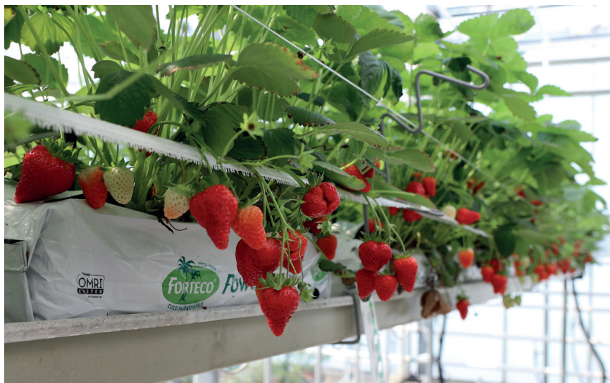
The organically grown strawberries from the trial

The results are promising. The strawberry harvest was higher on the organic nutrients. The trials for substances generally showed a higher content of vitamin C. These strawberries also scored nicely in the taste test. The follow-up trial with strawberries grown in trays with a peat-coco substrate has been in 'de Kas' since February.