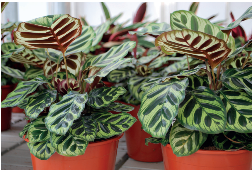
Calathea grown with organic nutrients from the bioreactor

Would you like to receive more information about the trials with potted plants in 'de Kas'? Please contact the Research & Development department via rd@vanderknaap.info or +31 (0) 174-296606.