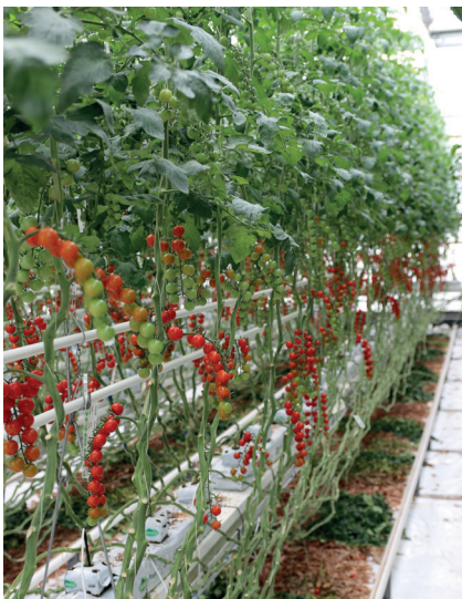
Tomatoes grown on coco substrate

Research was carried out into cultivation results in terms of growth and production, as well as the differences in substances and taste. As a rule, a conventional nutrient solution contains six macro and six micronutrients. With organic nutrients, however, the spectrum of micronutrients is much larger. All these micronutrients instigate different processes in the crop, resulting in differences in the levels of vitamins, antioxidants and carotene. In several trials, we examined the nutrients and components of the organically cultivated products compared to the non-organic products. In the case of tomatoes, we noted that the products grown with organic nutrients contained higher concentrations of substances and tasted better.