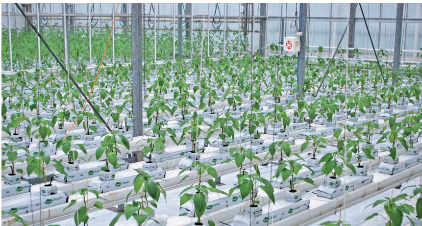
Bell peppers grown with organic nutrients from the bioreactor

For more information about the cultivation system or about the trials in 'de Kas', please contact the Research & Development department via rd@vanderknaap.info or +31 (0) 174-296606.